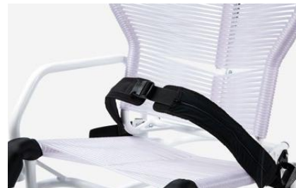
894 45° pelvic belt