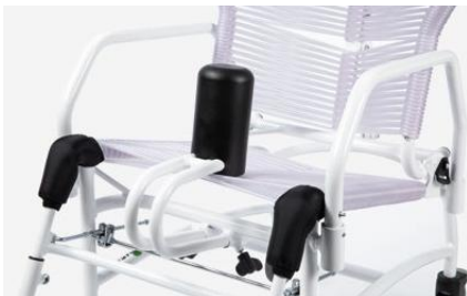
834 Abduction block adjustable in depth.